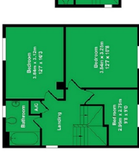
First Floor Approx. Floor Area 44.60 Sq.M. (480 Sq.Ft.)